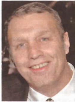
BY JACK JACKSON

It has been a long struggle to eliminate or prevent salt from corroding important components of trucks and buses. But what does this